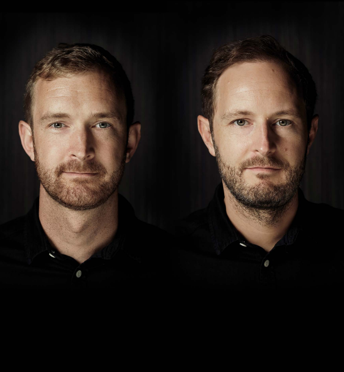
Inventor & CEOs